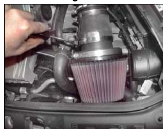
Fig. # 10