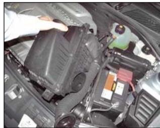
Fig. # 3