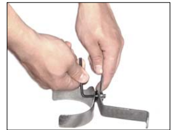
Fig. # 4