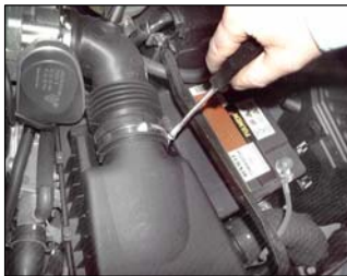
Fig. # 1

N.B. This kit should only be fitted to an unmodified vehicle