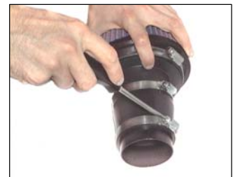
Fig. # 8