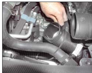
Fig. # 6