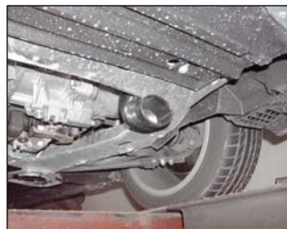
Fig. # 7