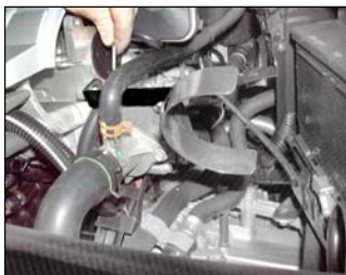
Fig. # 5