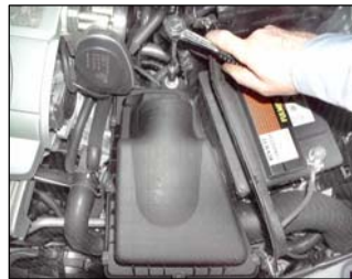
Fig. # 2