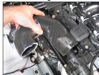
Fig. # 23