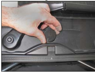
Fig. # 9