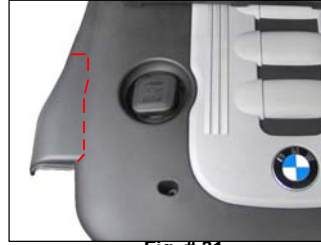
Fig. # 31