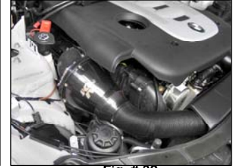
Fig. # 32