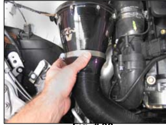
Fig. # 30