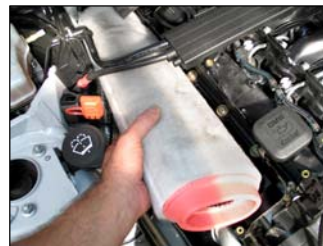
Fig. # 15