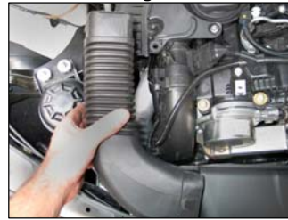
Fig. # 11