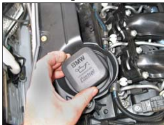
Fig. # 13