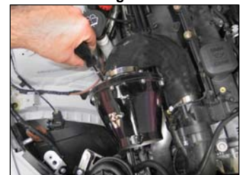
Fig. # 28