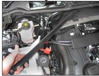
Fig. # 10