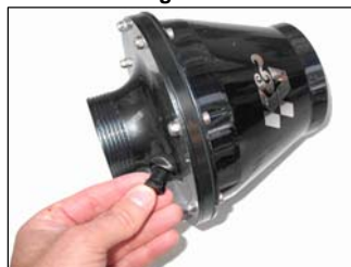
Fig. # 26