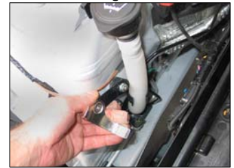
Fig. # 20