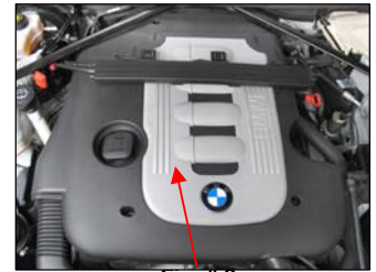
Fig. # 8