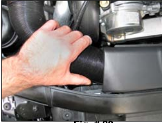
Fig. # 29