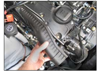
Fig. # 12