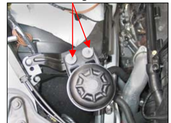
Fig. # 16