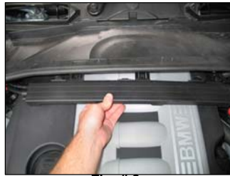
Fig. # 6