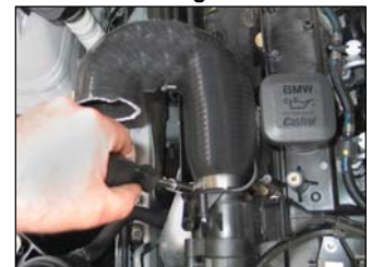
Fig. # 24