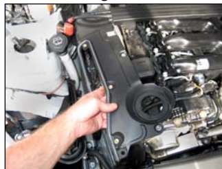
Fig. # 14