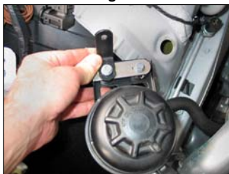
Fig. # 21