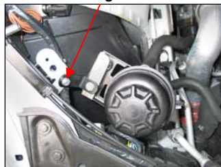
Fig. # 22