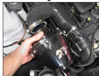
Fig. # 27