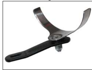
Fig. # 19