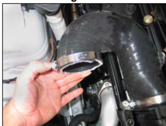
Fig. # 25