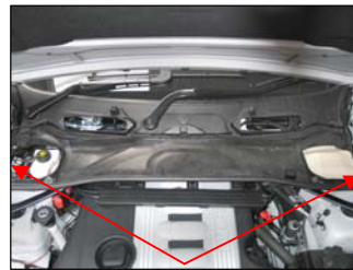
Fig. # 7